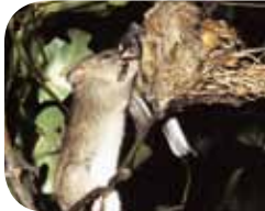
Tiritiri Matangi is free of harmful pests like mice & rats.

Tiritiri Matangi Island is a wildlife sanctuary; it is vital that it remains pest-free. Before you depart on the vessel please check your bags for rodents and insects and ensure your footwear, clothing and bags are clean and free of seeds. Please ensure your lunch is packed in a rodent proof container, preferably hard plastic. If you have any doubts or questions about your packed items, please ask sales staff or boat crew to advise. On arrival at the island, you will be met by one of the friendly DOC Rangers, who will outline the rules and regulations to ensure the Island remains pest-free and the wildlife remains unharmed. Please respect and obey these rules at all times.